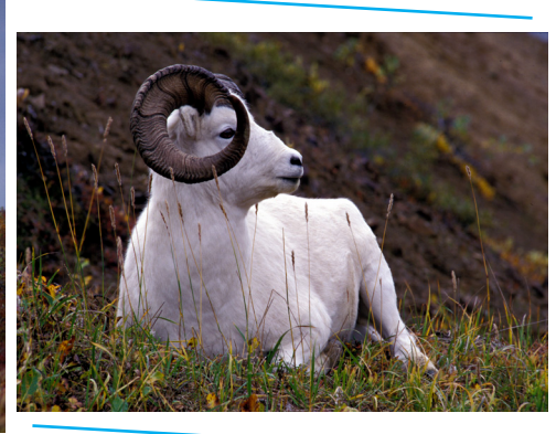
Wild animal, large and small roam unfenced lands. Bears, Moose and more.