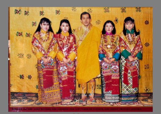
King and his 4 wives